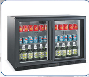
2 Door Back Bar