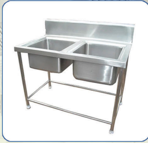
Double Sink Unit