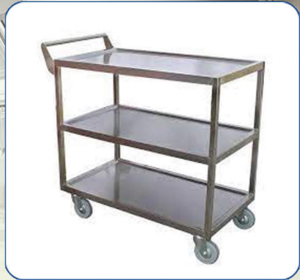
SS Service Trolley