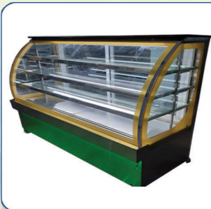
SS Normal Display Counter