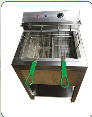
Deep Fryer Bulk