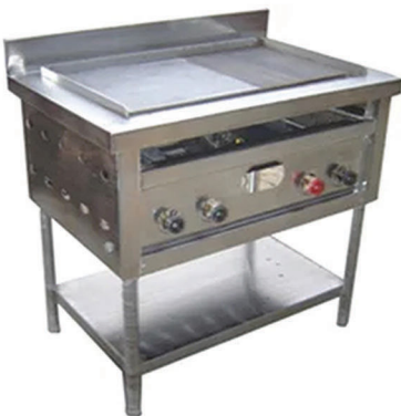
Dosa Plate with Griller