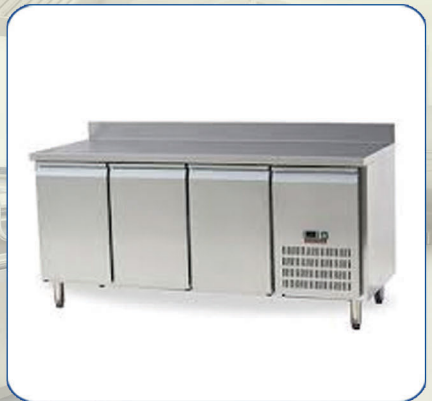
Three Door Undercounter Freezer