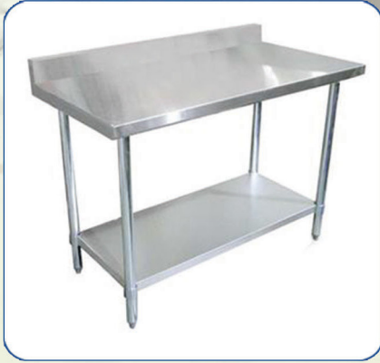
SS Work Table - Single Shelf