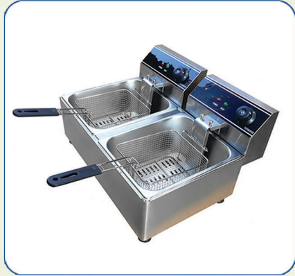
Deep Fryer Double