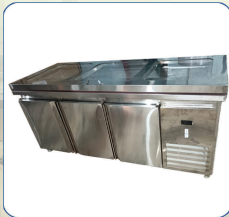
Glasstop Makeline Freeze