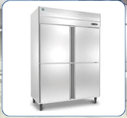
Four Door Vertical Freezer