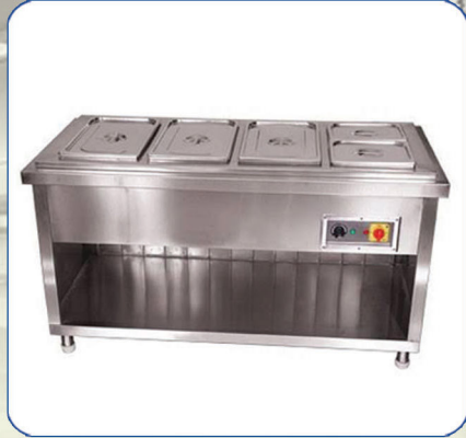
Food Service Bain Marie