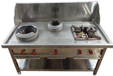
2+1 Chinese Cooking Range