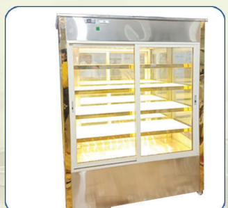
Vertical Refrigerated Counter