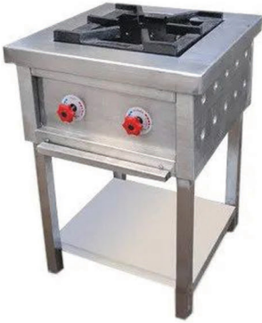
Single Burner Cooking Range