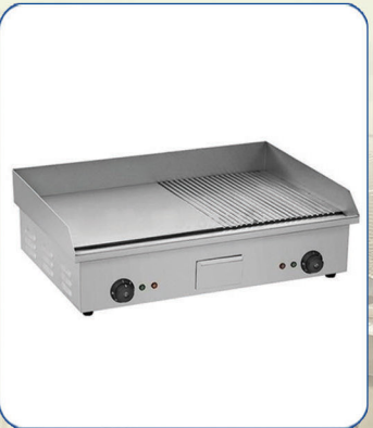
Plain + Griddle Plate