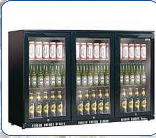
3 Door Back Bar