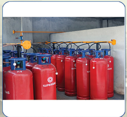
LPG Manifold System