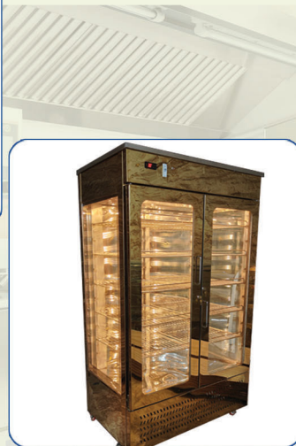
Verticle cake display counter