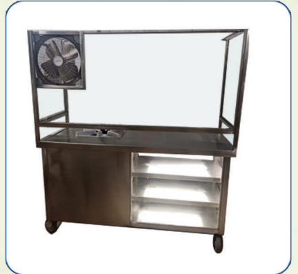
Roll Counter with Display