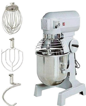
Planetary Food Mixer