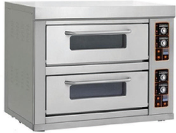
Single Deck Double Tray Oven