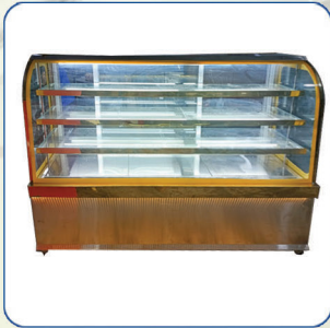
J Bend Glass Counter