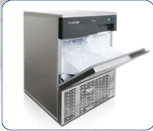
Ice Cube Machine