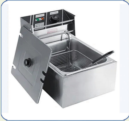
Deep Fryer Single