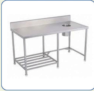
Soiled Dish Landing Table