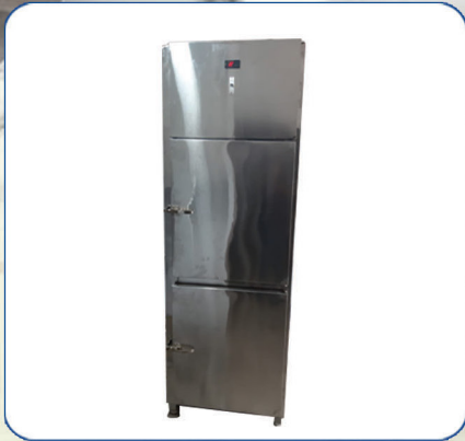
Two Door Vertical Freezer