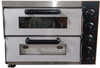
Baby Pizza Oven - Double