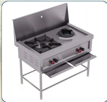
Indian + Chinese Range