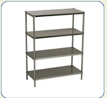
Clean Disk Rack