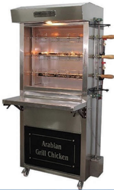
Chicken Rotisserie Machine