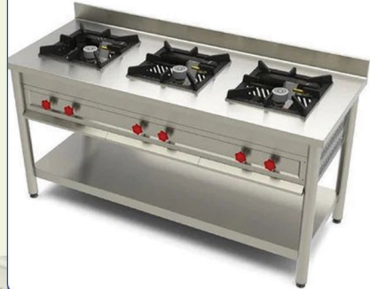
Three Burner Cooking Range