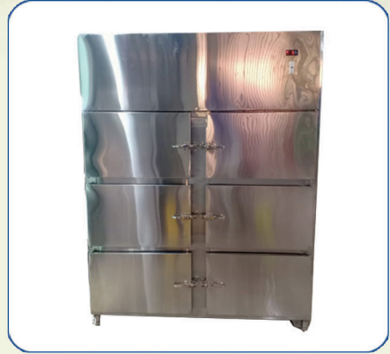
Sandesh Dram Storage Freezer