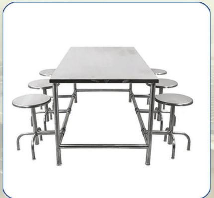
Dinning Table with Foldable Chair