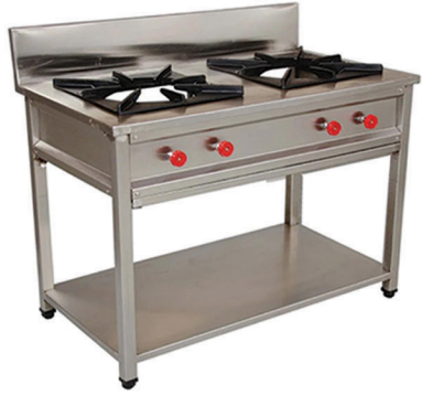
Double Burner Cooking Range