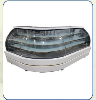
Corian Doom Glass Counter