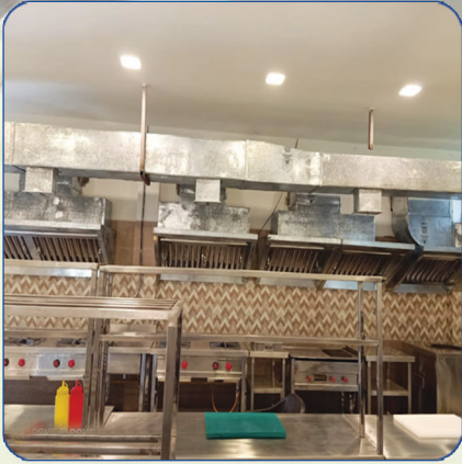
Exhaust Hood - Wall Mounted