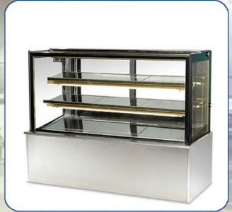
Straight Glass Normal Display Counter