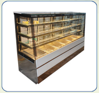
Corian & Rose Gold Counter