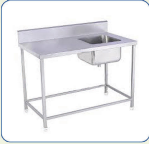
SS Sink With Table