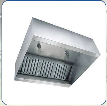
Exhaust Hood-Box Type