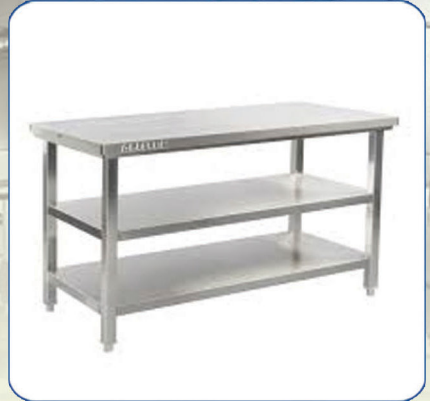
SS Work Table - Double Shelf