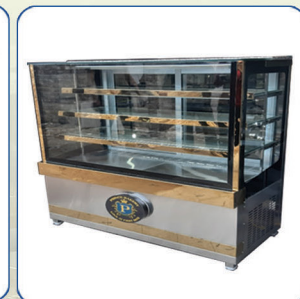
SS Normal Display Counter