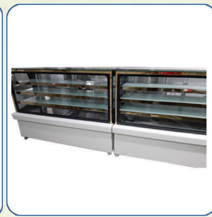
Corian Straight Glass Counter