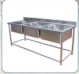
Three Sink Unit