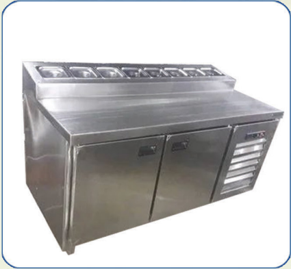
Makeline Preparation Chiller