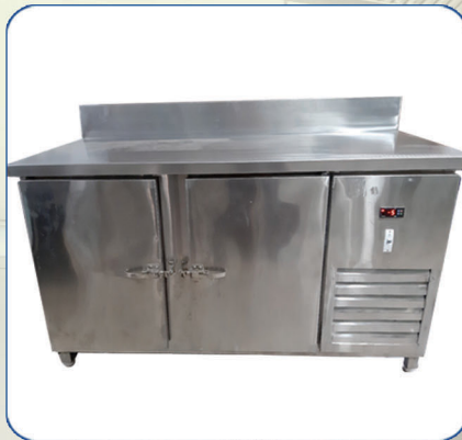
Two Door Undercounter Freezer