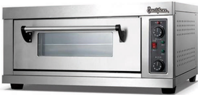
Single Deck Single Tray Oven