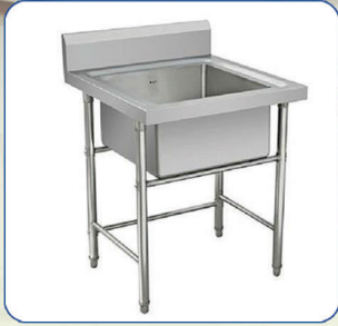
Single Sink Unit