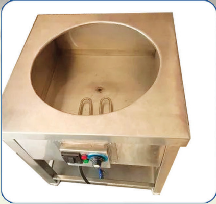
Biryani Bain Marie