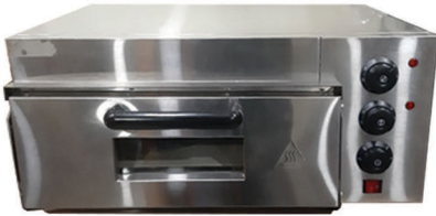
Baby Pizza Oven-Single