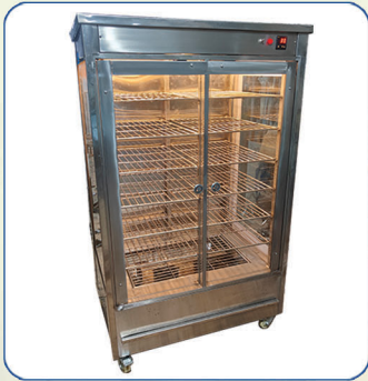
Vertical Hot Counter